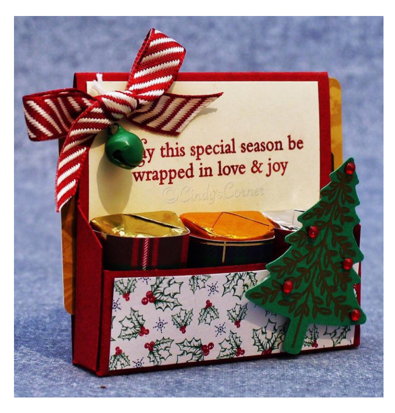
Inspired by Gloria Plunkett